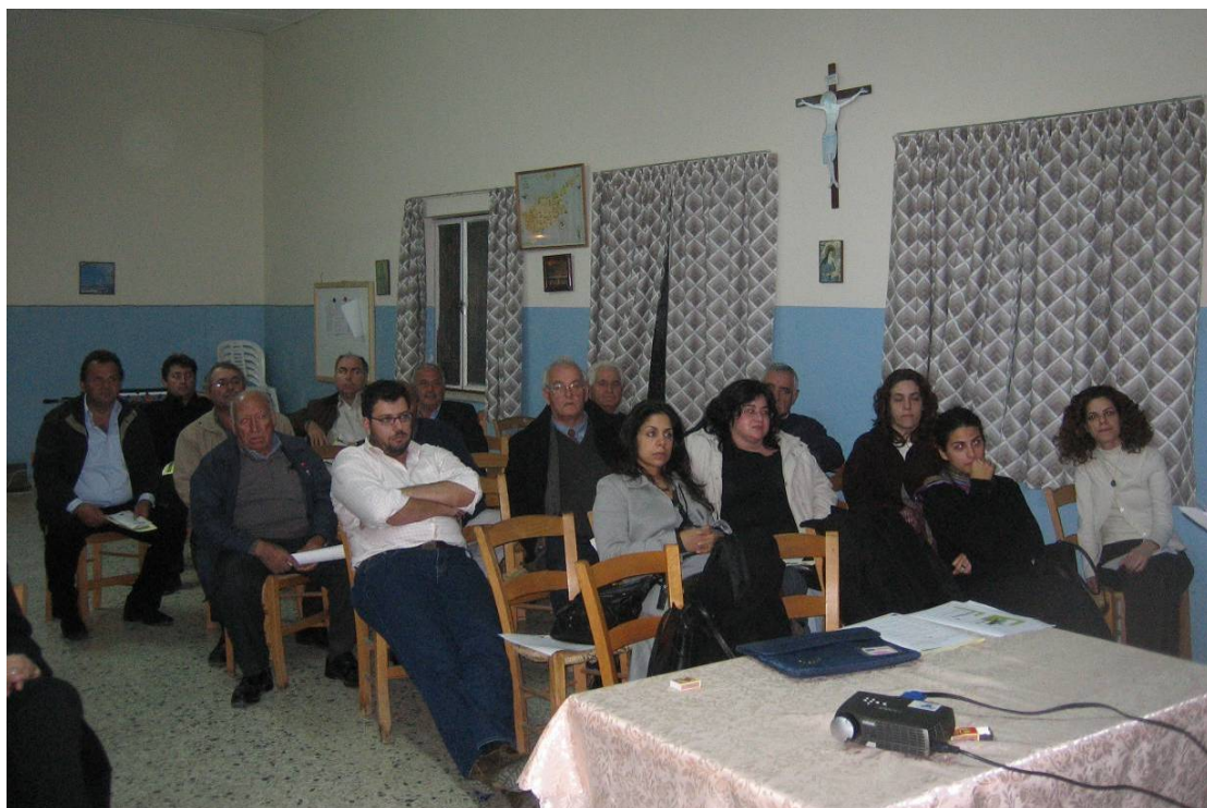
Figure 13 – Photo from the training course