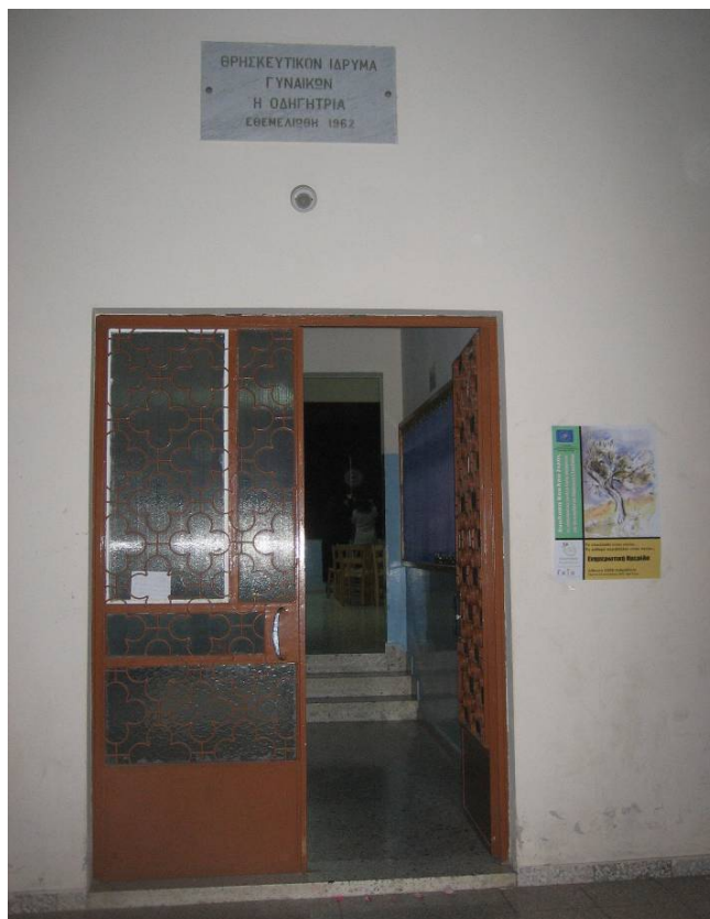
Figure 2 – The OHEN Room where the training course took place