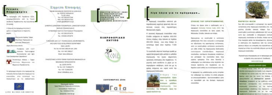
Figure 5 – Course leaflet distributed during the training course