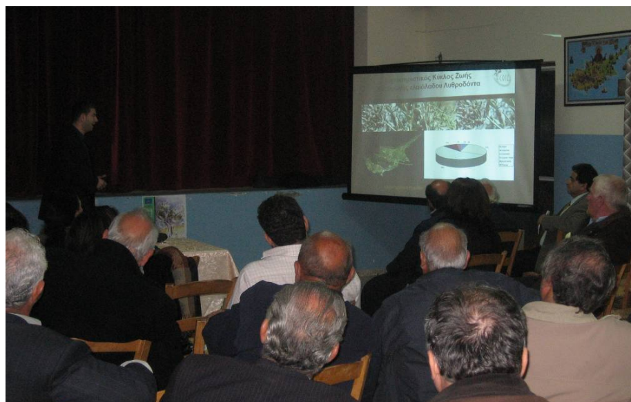
Figure 3 – Photo from the training course