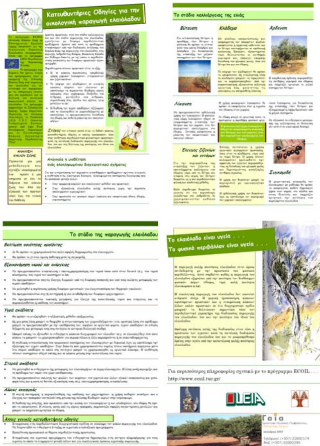
Figure 4 – Training material distributed during the training course

Training material was distributed to all participants, during their registration.